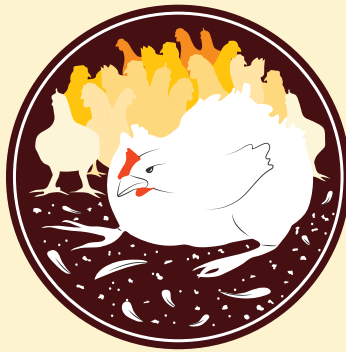
TRAPPED IN FILTH